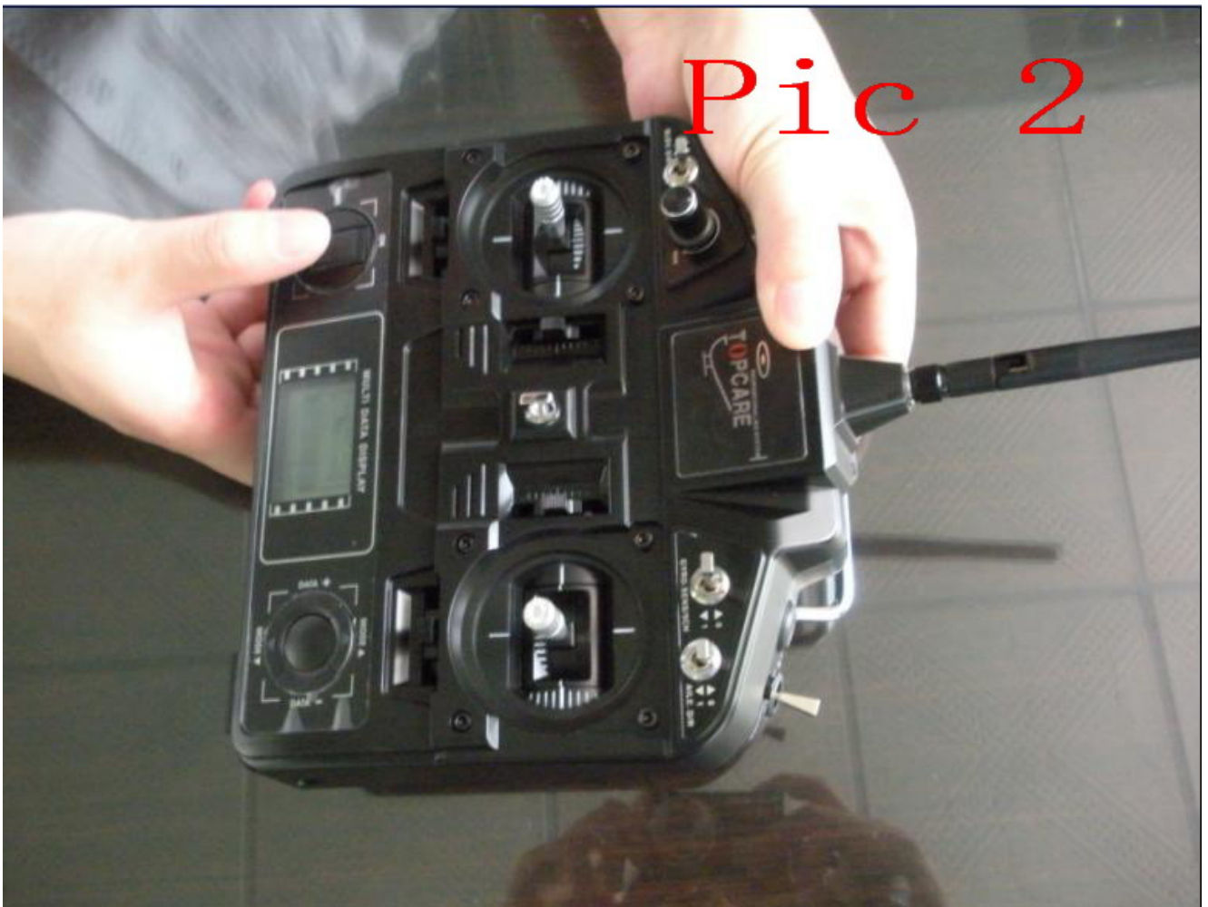
2) put the binding plug into the BAND jack and connect the receiver power. Picture 3 and 4